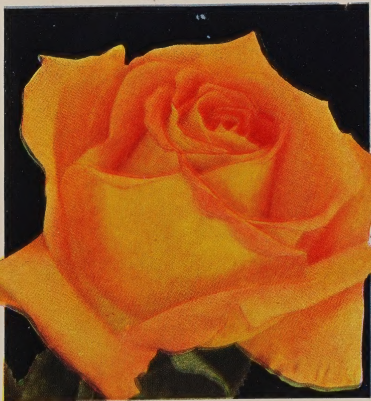
McGREY'S SUNSET—$1.25 each; 3 for $3.15 (Plant Patent No. 317)